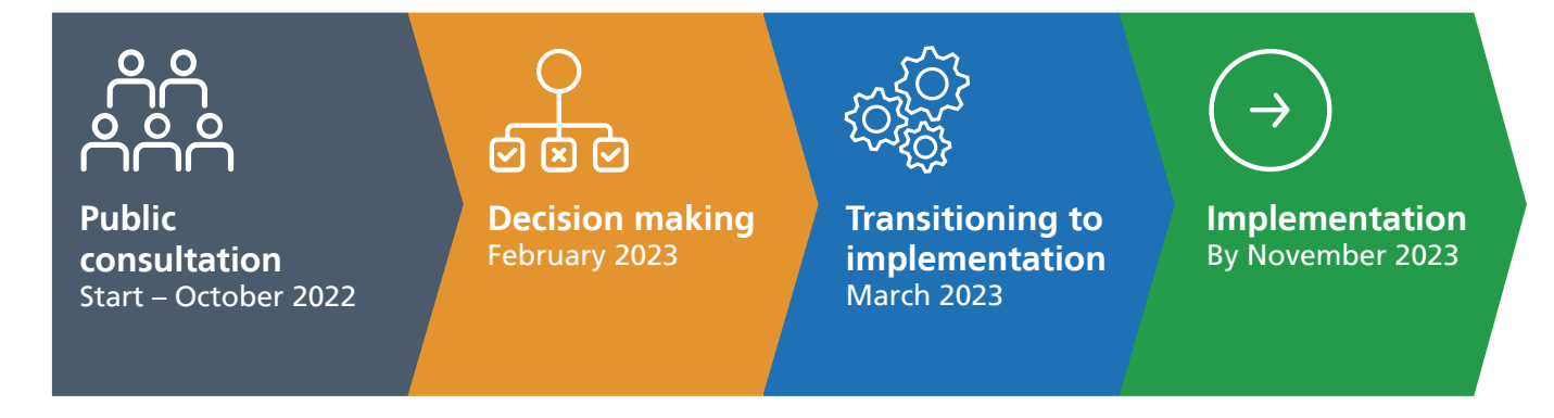
Figure 3 – Elective orthopaedic centre timelines overview programme